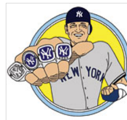
The Return of Yankees Exceptionalism