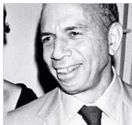
The Last Old-Media Tycoon

Made-off With Madoff Taken Care Of, Attention Turns to His Family »