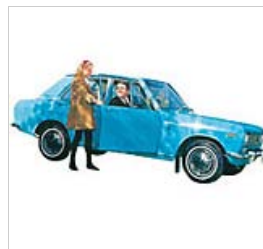
How 1959 Changed New York City