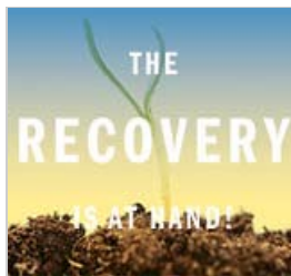
The Recovery Has Arrived. Or Has It?