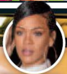
Rihanna celebrated her grandfather's 86th birthday at Philippe.